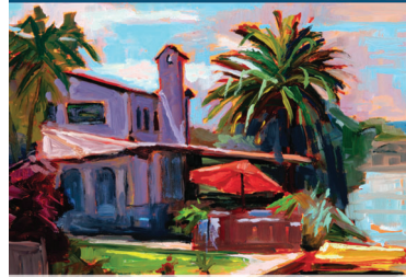
Cover art: The Red Umbrella 12"x12", oil on hardboard, Private collection.

SF on the Bay is committed to furthering community efforts towards Climate Action initiatives. Big change starts small! Please join us. Subscribe at sfonthebay.com/clean-waters